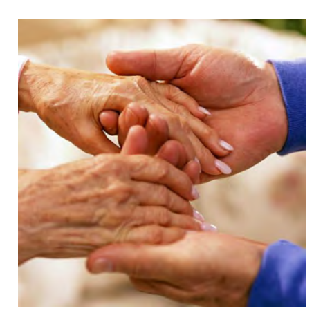
God sets the Solitary in families Psalms. 68:6